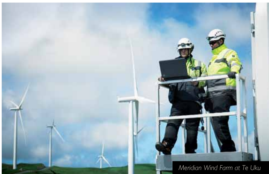
Meridian Wind Farm at Te Uku

Potential growth and economic development are both challenges and opportunities which will have a big impact on our district. The infrastructure and facilities needed to provide for a bigger population will put demands on the council's budgets during the next 10 years. Equally, growth also provides us with the potential to grow economically.