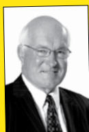
Peter Harris Mayor