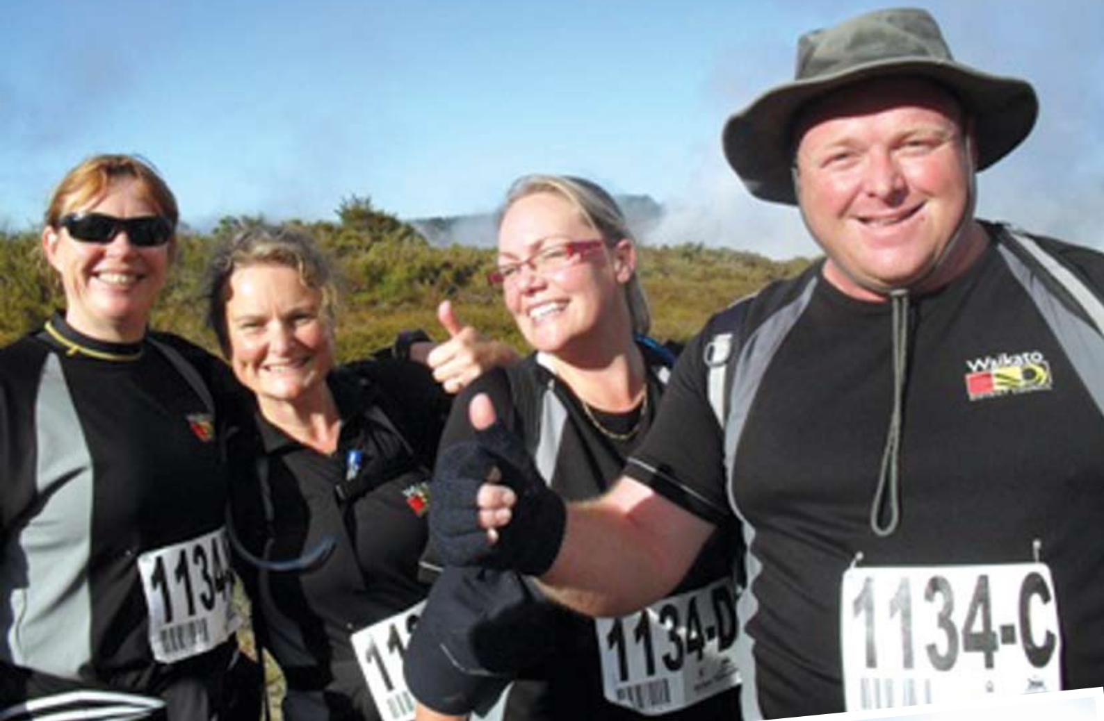
The exuberant Waikato District Council staff teams after walking a gruelling 100kms.